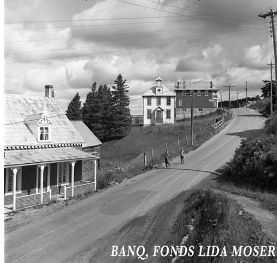
PREMIER BUREAU DE POSTE ET ÉCOLE, PORT-DANIEL, 1950