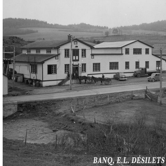
ENTREPOT FRIGORIFIQUE GASCONS, 1951