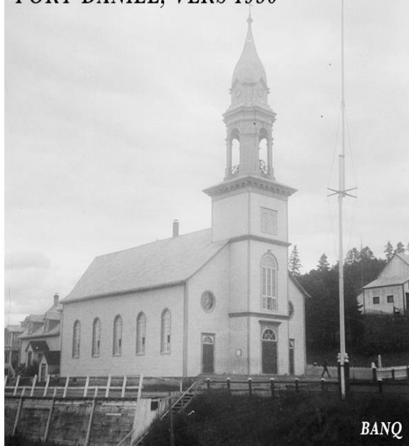
ÉGLISE SAINT-GEORGES, PORT-DANIEL, VERS 1950