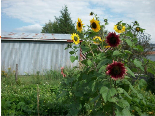
The Community garden

For lack of succession to form a new Board of Directors, the Community Garden of the Old Convent of Gascons inc. was forced to terminate its ASSOCIATION status and proceed with the liquidation of its assets.